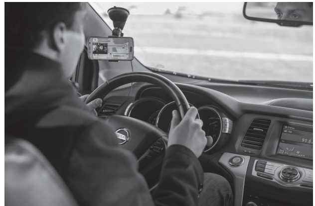
Fig. 1 The use of mobile application, running on the smartphone mounted on the windshield of a car

The implementation of proposed mobile driver assistance system has been developed for Android-based mobile device. A Mobile Vision API framework [3] provided by Google is used for finding and recognizing objects in photos and videos. The framework includes detectors, which locate and describe visual objects in images or video frames, and an event driven API that tracks the position of those objects in video. The example of application for situation analysis, running on the smartphone Samsung Galaxy S6 that is mounted on the windshield of a car, is shown in the Fig. 1. The details can be found in [4].