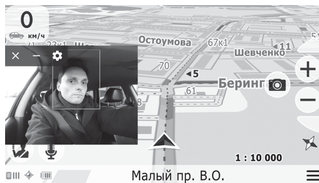
Fig. 2 The running mobile driver assistant, showing the normal state of the driver